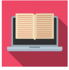
Ebooks & More